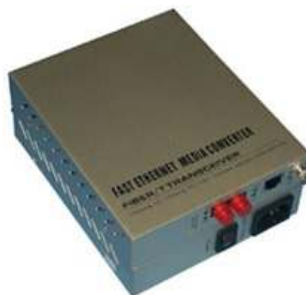
Standalone media converter (AZ-1000M-LFP)