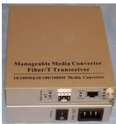
Standalone media converter (AZ03-1000M-SFP)